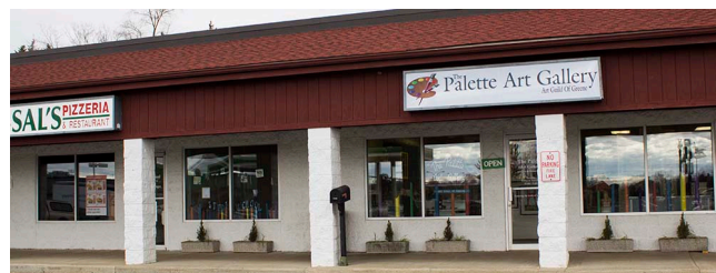
west end of Stanardsville.

One of the central activities of the Art Guild is to sponsor the Palette Art Gallery, an artists' co-op which has recently moved from a tiny space on the main street of Stanardsville to a much larger storefront space between Sal's Pizza and the Great Valu grocery store at the