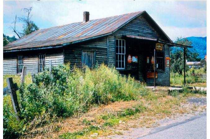
The Elmo Utz store once stood just down the road from Graves Chapel. Photo Ca. 1950.

The DnA Band will share their musical talents. Enjoy light refreshments and conversation at the Chapel throughout the day.