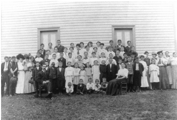
Graves Mill families in front of Graves Chapel, circa 1905-1907.

Members of the Graves, Aylor, Berry, Creel, Estes, Fitzhugh, Hawkins, Kendall, Kite, Knighting, Lillard, McDaniel, McMullen, Melone, Slaughter, Shotwell, Sims, Smith, and many other families will be present to discuss their memories of the mountain life in Madison. Archival materials, including early film footage of the area and historic maps, will also be on display.