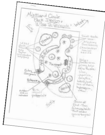
Samples to Illustrate the Kinds of Elaborate Designs We Received!