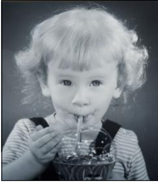
This little girl grew up to be???