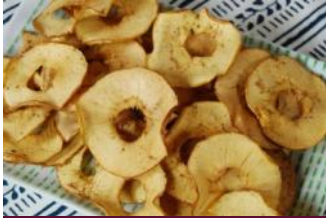
Baked Apple Chips